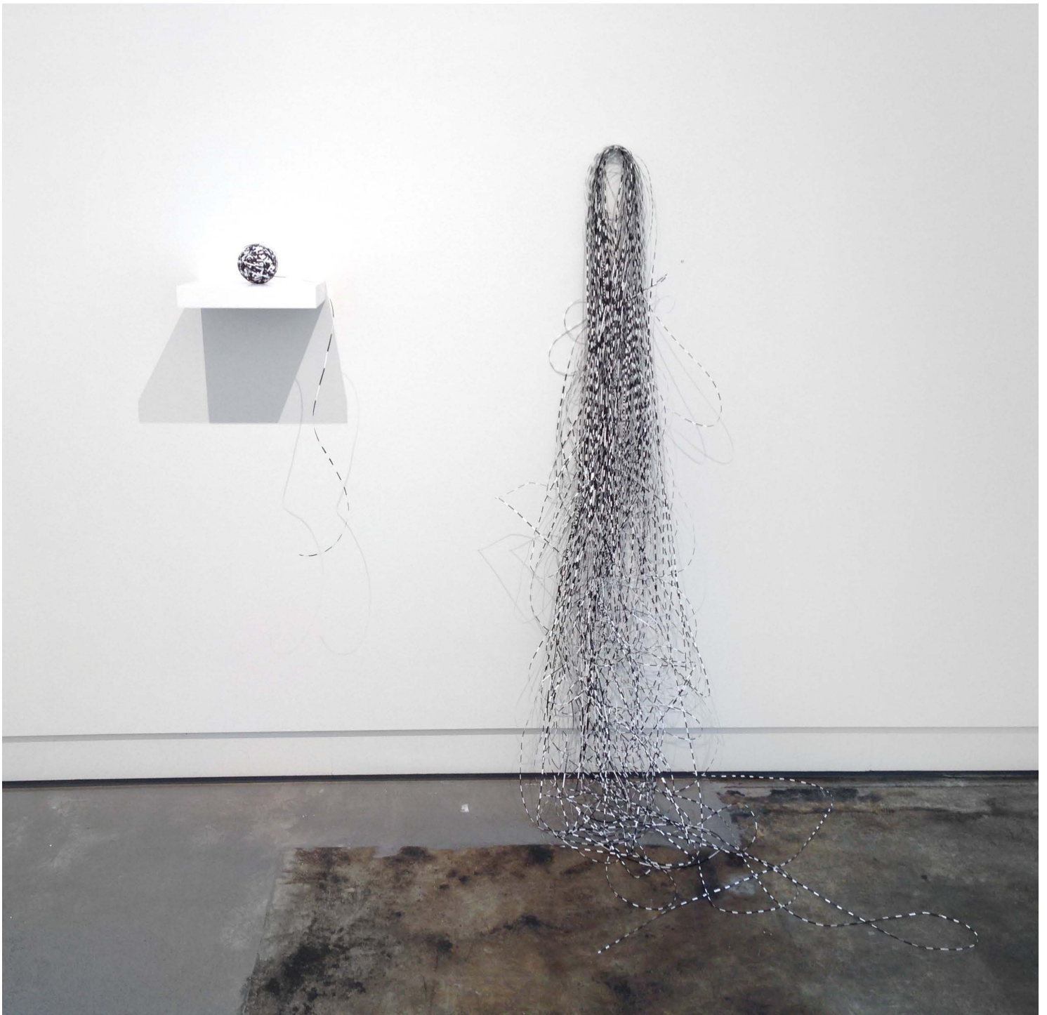
Al Munro, 'Measuring Tape 2 (Standard Measures Series)' 2013, pigment marker on hand-cut paper, tennis ball, edition of 10, 7cm diameter Al Munro, 'Measuring Tape 1 (Standard Measures Series)' 2013, pigment marker on hand-cut paper, dimensions variable