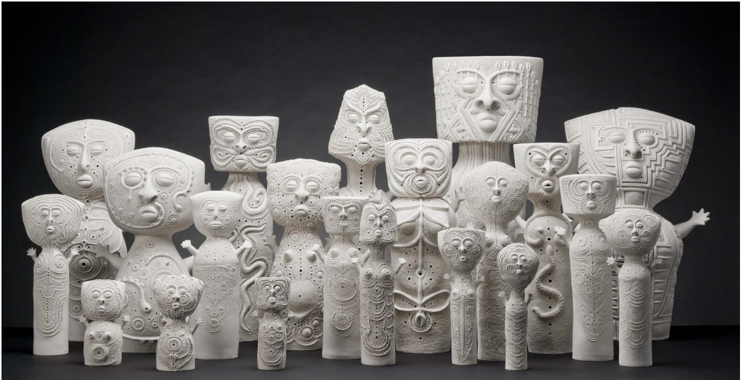
Lorraine Guddemi, '21 Reasons to Repeat Myself' 2013, porcelain, dimensions variable