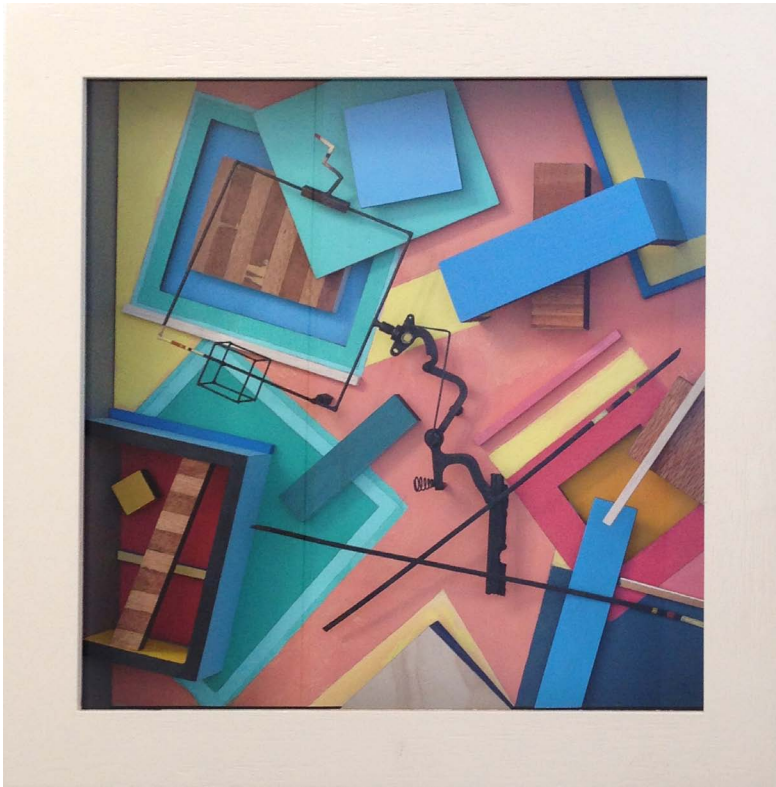
Leslie Oliver, 'A Layered Play' 2014 painted timber, copper plated steel, 34 x 34 x 6cm