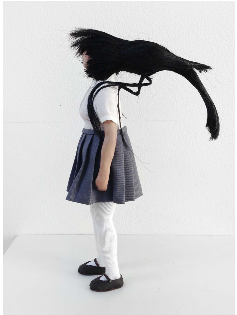
Mylyn Nguyen, 'Ponytail (Bird)' 2014 oil paint on polymer clay, synthetic hair, fabric, leather, wire 25 x 13 x 7.5cm