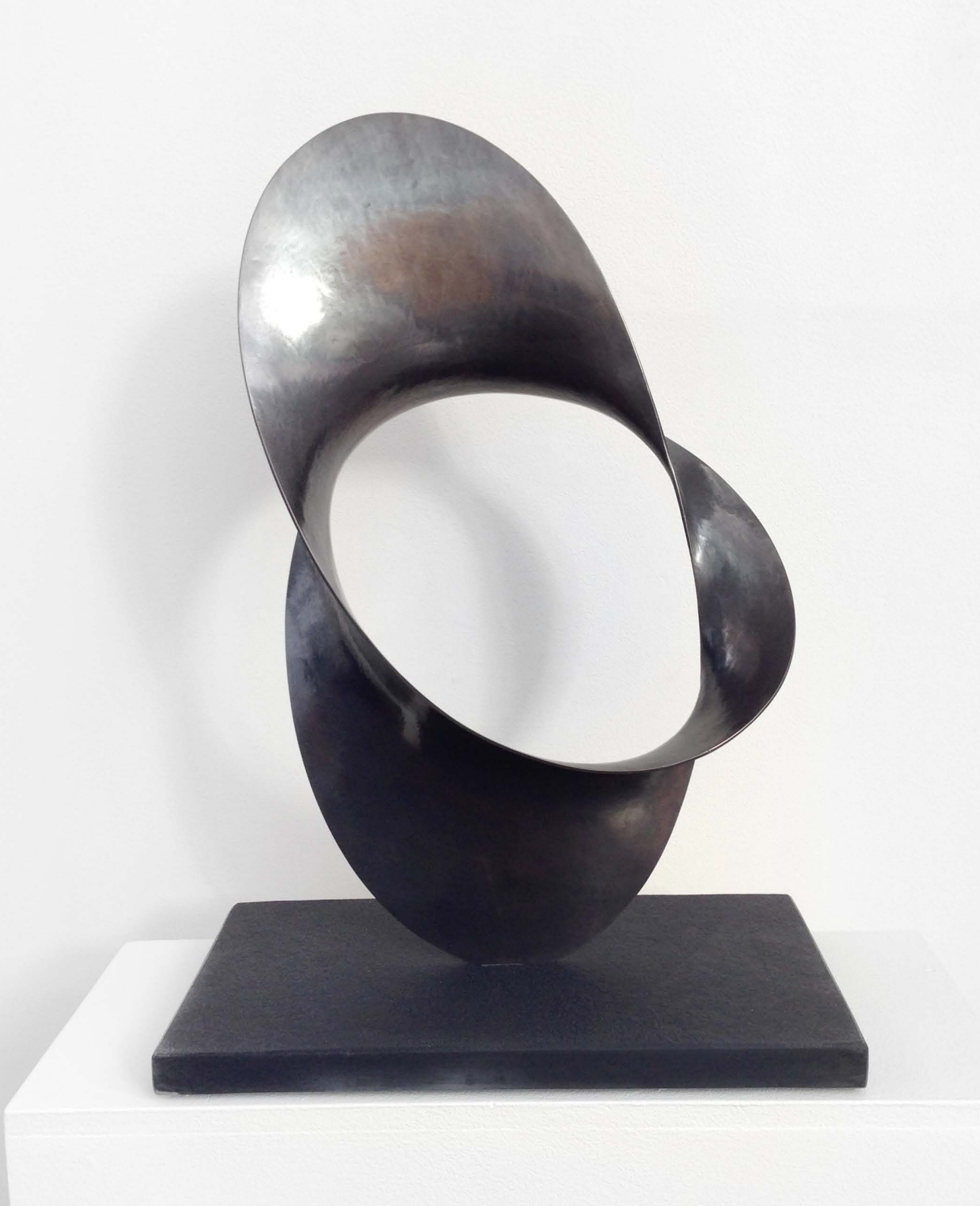
Benjamin Storch 'lunar' 2014 patinated copper on black limestone 53 x 42 x 24cm