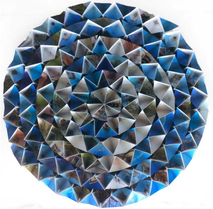
Lisa Giles, 'SOLD #5' 2013 origami folded, reclaimed page of the McGrath Real Estate Weekly Magazine 8 x 52 x 52cm