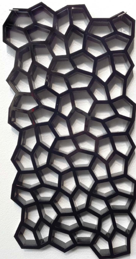
Lezlie Tilley, 'Network 5 4' 2013 laser cut acrylic, 37.5 x 20.5cm