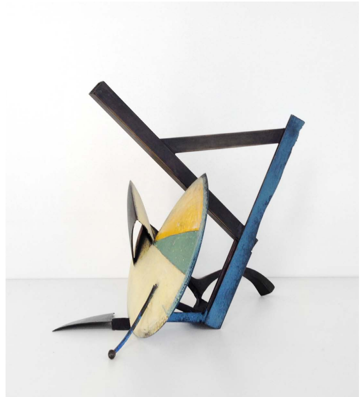
Leslie Oliver, 'Flip, Flop' 2013 painted & patinated brass, 15 x 18 x 11cm