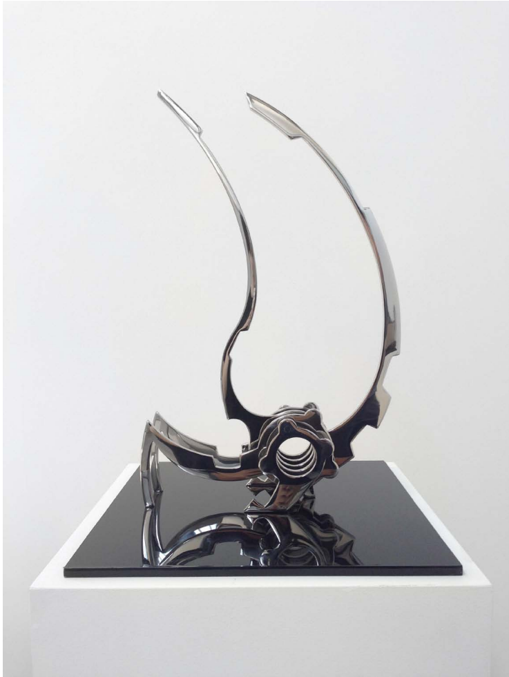
Andrew Best, 'Neptune' 2014 polished 8mm stainless steel, 54 x 34 x 12cm