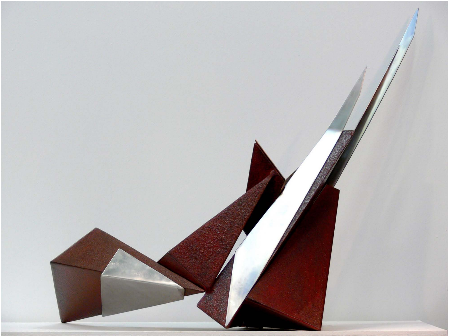
Jacek Wankowski, 'Samurai Blade II' 2013, weathered steel and stainless steel, 90 x 75 x 55cm