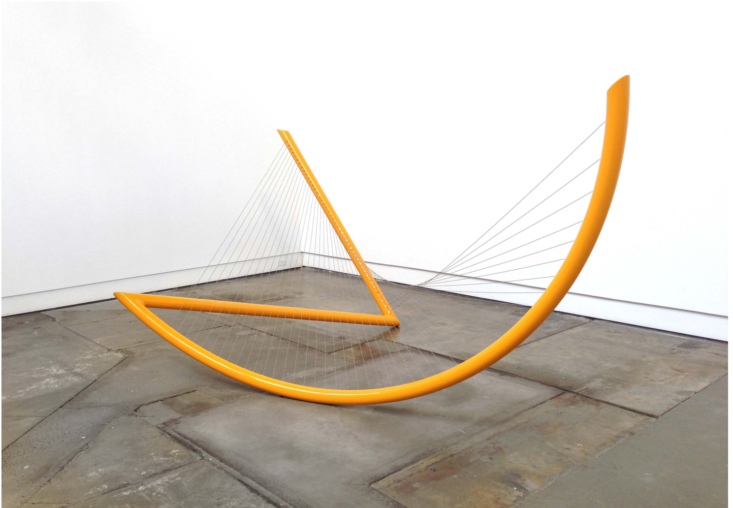
Greer Taylor, 'crosswind' 2013, aluminium, stainless steel, nickel plated brass, 160 x 320 x 220cm