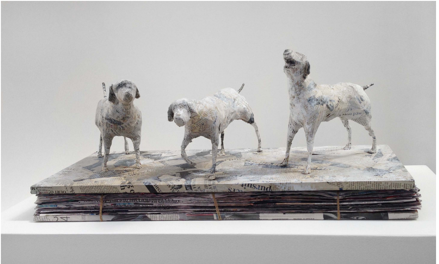
Marguerite Derricourt, 'Newshounds' 2013, plaster, wire, newspaper, 23 x 70 x 27cm