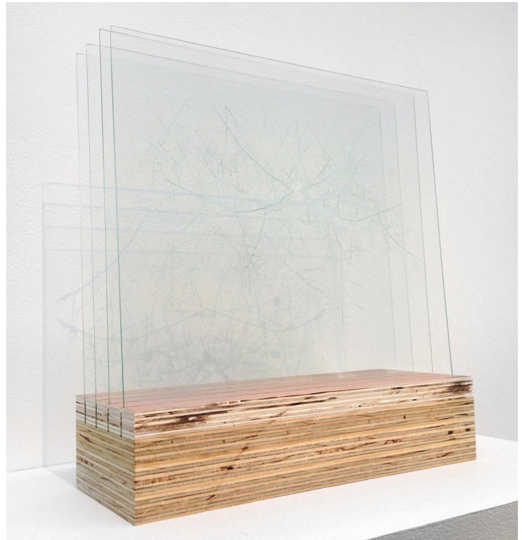
Emily McIntosh, 'Arborization' 2014 etched glass, timber stand, 33 x 32 x 11cm