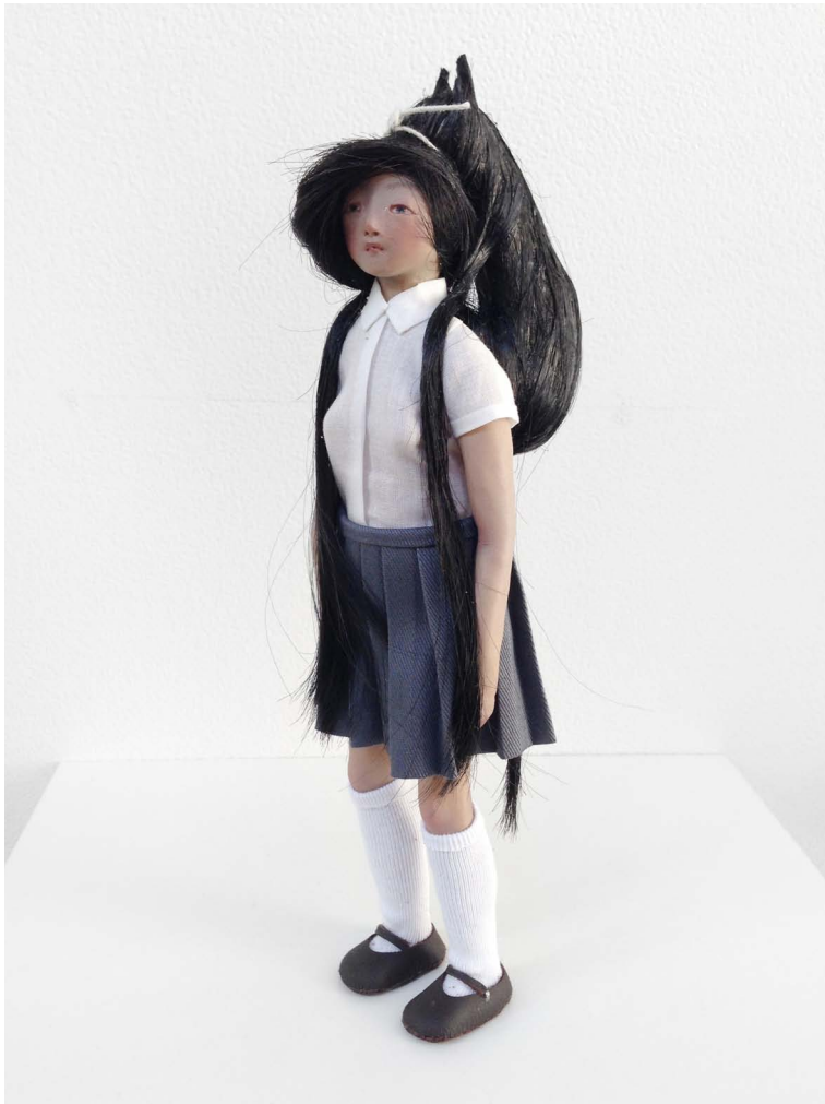
Mylyn Nguyen, 'Ponytail (Cat)' 2014 oil paint on polymer clay, synthetic hair, fabric, leather, wire 26 x 8 x 7.5cm