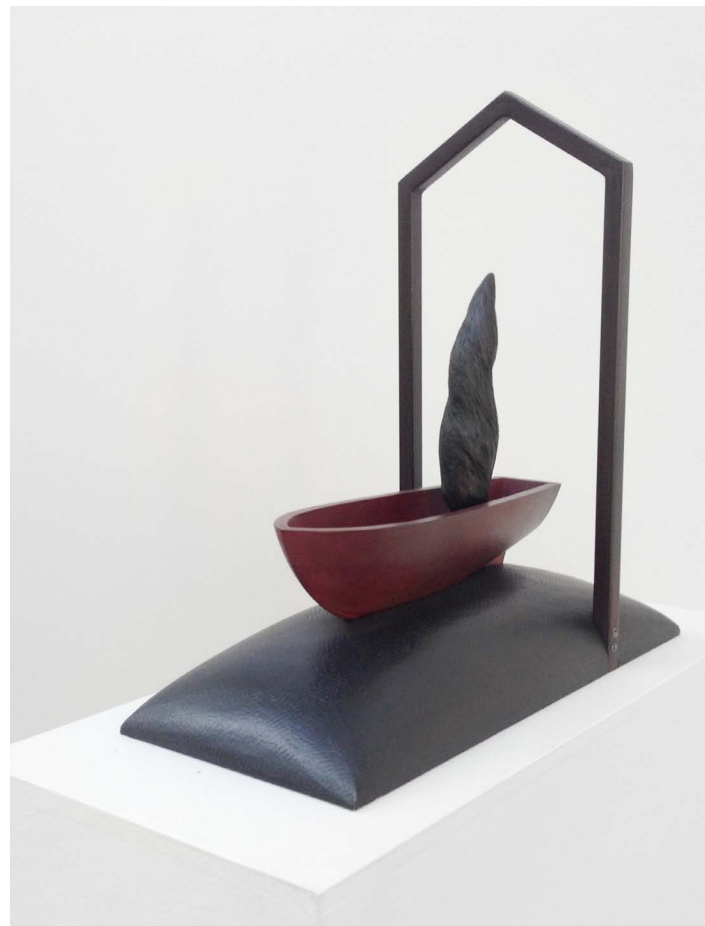
Peter Tilley, 'The Ark' 2013 cast iron, steel, painted timber, 46 x 47.5 x 21.5cm