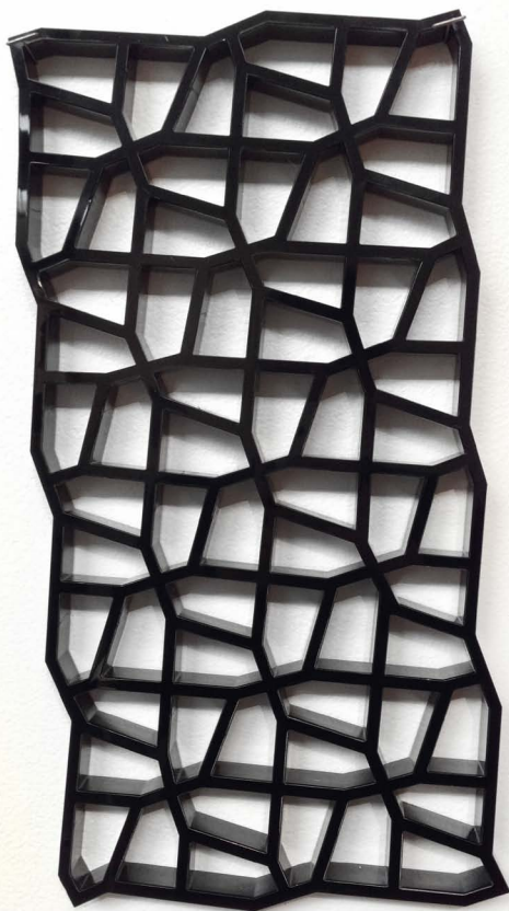
Lezlie Tilley, 'Network 1 4' 2013 laser cut acrylic, 39.5 x 20.5cm