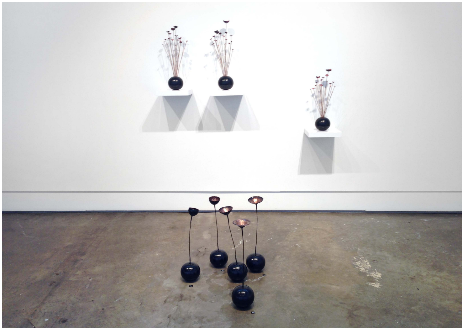
Walter Brecely, 'Organically Challenged' 2013, recycled lawn bowls, copper, 53 x 24 x 24cm each Walter Brecely, 'Lawn Weeds' 2013, recycled lawn bowls, goblets, copper ceramit, 46 x 11 x 11cm each